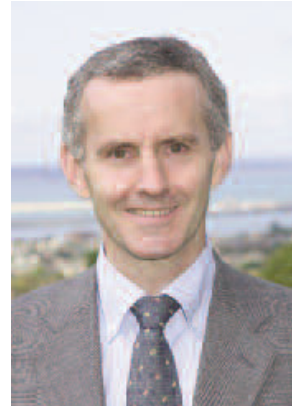
Mr. John Gormley, T.D., Minister for the Environment, Heritage and Local Government.

A handwritten signature in black ink that reads "Ciarán Cuffe".